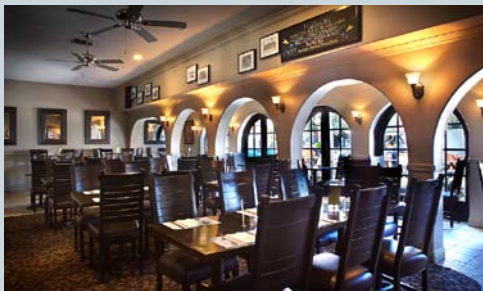
K'ya Bistro and joining Lobby 120 guests seated dinner or Cocktail reception. Amplified/Live Music & Dancing Allowed