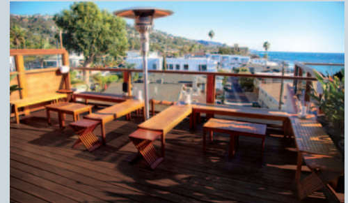
South Lounge 20 Guests seated dinner or cocktail style (only used as a combination with Catalina Room)