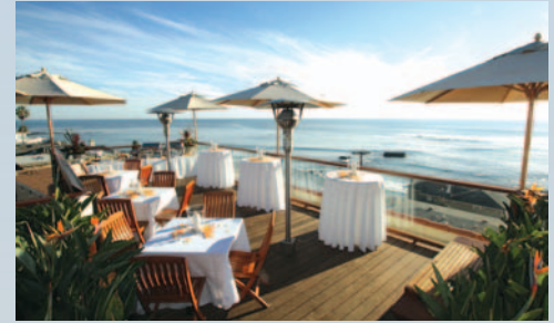
South Pointe Extended 30 guests seated dinner or 40 guests cocktail style (cocktail style photographed)