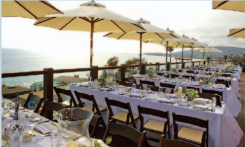
3/4 Deck Inclusive Package 120 guests seated dinner or cocktail style

Daytime: 11AM-3PM (Daily), Evening 5PM-9PM (Sunday-Thursday), 5PM-10PM (Friday-Saturday)