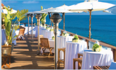
1/2 Deck Inclusive Package 50 guests seated dinner or cocktail style (accommodates an additional 10 guests for an additional fee per person)