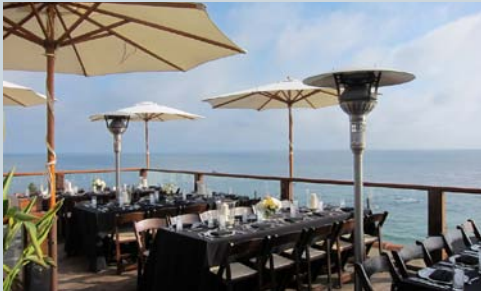
South Pointe 20 guests seated dinner or 30 guests cocktail style