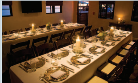
The Catalina Room 30 guests seated dinner or cocktail style May be combined with the South Lounge to accommodate an additional 20 guests.